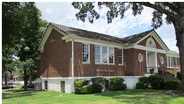
ARAS-HSU Research Station, Proctor Hall.