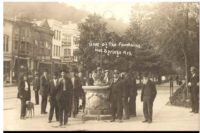
Hot Springs National Park, Hot Springs, Arkansas. https://www.facebook.com/HotSpringsNPS/

Hot Springs National Park continues its Outdoor Ranger Guided Walks daily from 2 – 2:45 p.m. (but not 01/01). Join a ranger for a 45-minute program in the historic Bathhouse Row and Grand Promenade area. Tours begin at the Fordyce Bathhouse and may be modified for weather. The park also offers Fordyce tours daily at 10:30 a.m. (and Saturday at 1 p.m.) Join a ranger for a 20-30-minute program inside of the Fordyce Bathhouse Visitor Center. Reservations are not required. Plan your visitor using the NPS app or https://www.nps.gov/hosp/index.htm .